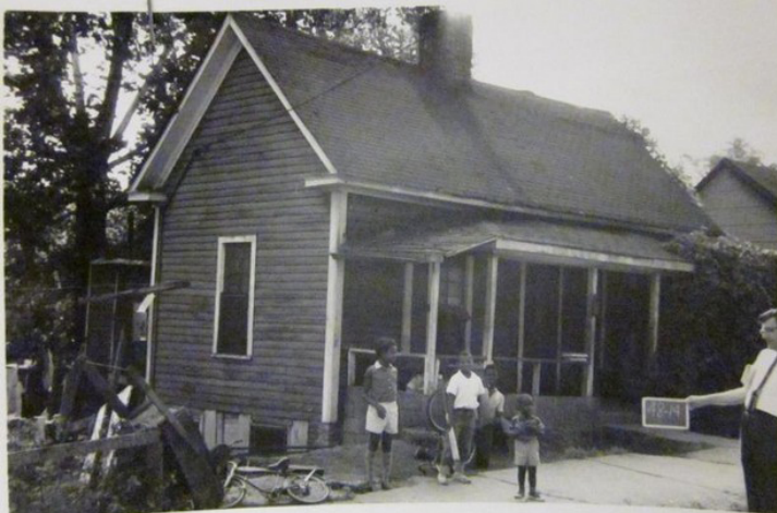
Children stand in front of a home in Asheville's Southside neighborhood in the mid-1960s. (photo courtesy of Housing Authority of the City of Asheville Records, Special Collections, D. H. Ramsey Library, UNC at Asheville).

Over the past century, Americans in hundreds of thousands of neighborhoods have been uprooted and relocated, their homes torn down and replaced with highways, parks, high-rise buildings, and other structures intended to