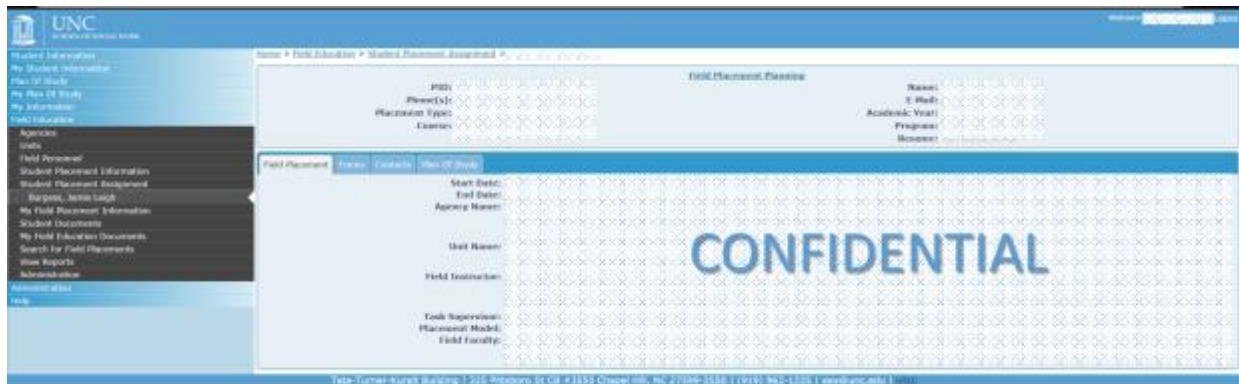
Figure 3: Detailed information on each Field Placement agency identified by a search.

educators and agencies. Specifically, access to the system is secured by authentication via user identifier and password, and authorization for webpage access and level of access (i.e., view only versus view/edit) is controlled by a user Access Control List (ACL) that automatically assigns rights to users. An additional feature is the ability to enable an auto-lockdown of pages after certain tasks are complete. For example, student Plans of Study can be automatically locked from further editing by students after advisor approval.